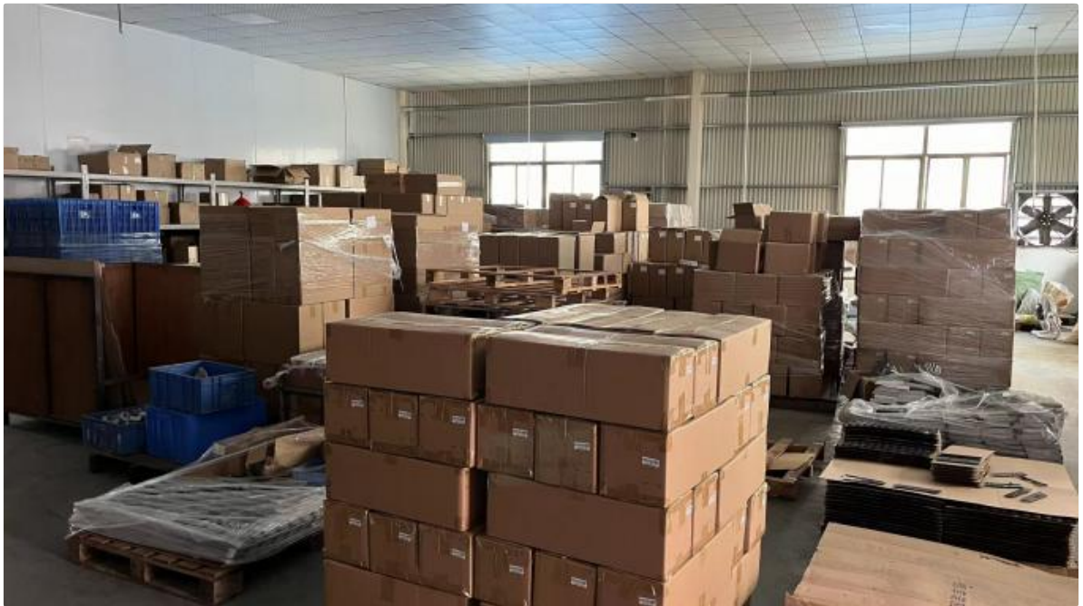
Packing & Delivery