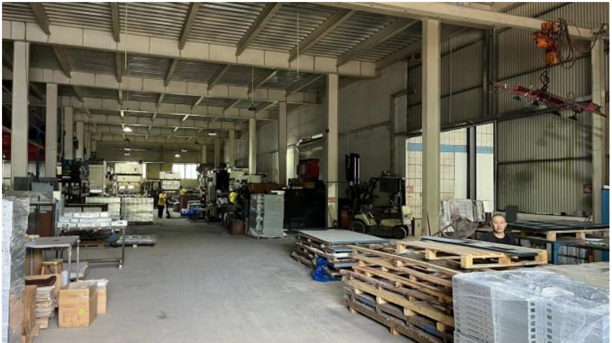
Packing & Delivery